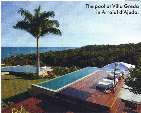
The pool at Villa Greda in Arraial d'Ajuda.