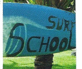
A sign for surf school in Costa Rica.