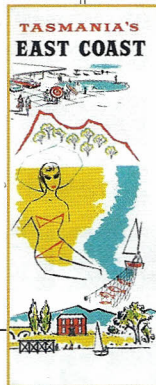
Avalon City Retreat. Inset, above left: a 1958 travel guide.

Avalon City Retreat is a glass omnipod with iPods, swung on top of a nine-storey building, with 360-degree views, swanky kitchens packed with goodies, two double bedrooms with jersey-knit sheets, cashmere throws, a deck, barbie and table for 10—have a ball. Not for the halt or lame, as there's a final 24 steps from the lift. Far below the ferry chugs to MONA. And, yes, it includes WiFi, but no maid service, so you'll need to pick up your own socks. (avalonretreats.com.au)